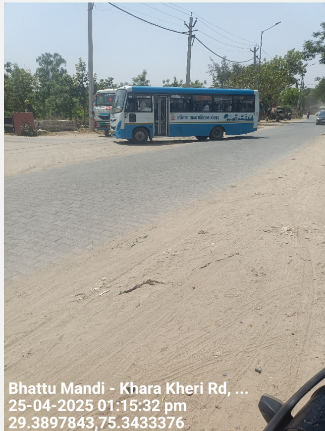
Bhattu Mandi - Khara Kheri Rd, ... 25-04-2025 01:15:32 pm 29.3897843,75.3433376

Take Photo of Person Met Inside the Shop