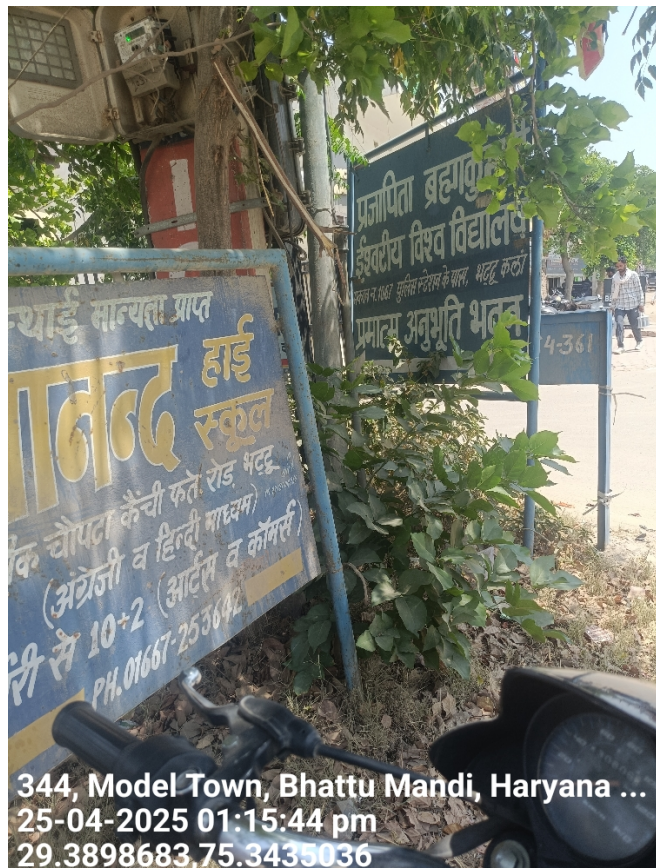
344, Model Town, Bhattu Mandi, Haryana ... 25-04-2025 01:15:44 pm 29.3898683,75.3435036

Take Photo of QR Code/Soundbox/EDC Machine