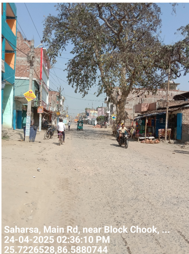
Saharsa, Main Rd, near Block Chook, ... 24-04-2025 02:36:10 PM 25.7226528,86.5880744

Shop front photo with full vertical viewpoint i.e; shop board, sealing, entrance, ground on which the shop is established (cemented, pilers, bricks, stands, mud, wheels etc.)