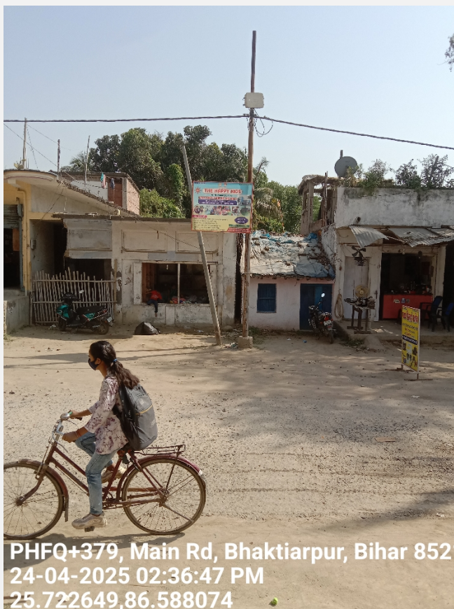
PHFQ+379, Main Rd, Bhaktiarpur, Bihar 8521 24-04-2025 02:36:47 PM 25.722649,86.588074

Take Photo of Person Met Inside the Shop