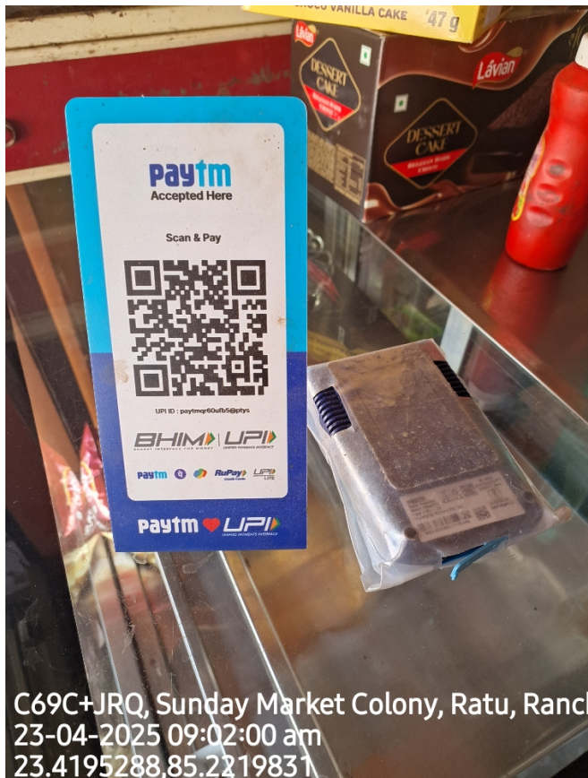
C69C+JRQ, Sunday Market Colony, Ratu, Ranchi 23-04-2025 09:02:00 am 23.4195288,85.2219831

Take Photo of QR Code/Soundbox/EDC Machine