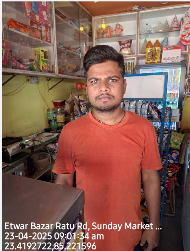
Etwar Bazar Ratu Rd, Sunday Market ... 23-04-2025 09:01:34 am 23.4192722,85.221596

Take Photo of Person Met Inside the Shop