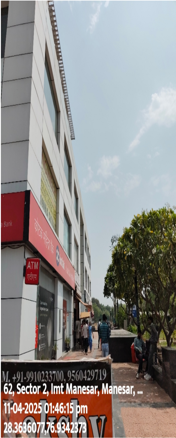
Office setup with employees