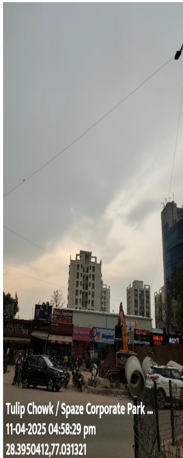
Tulip Chowk / Spaze Corporate Park ... 11-04-2025 04:58:29 pm 28.3950412,77.031321