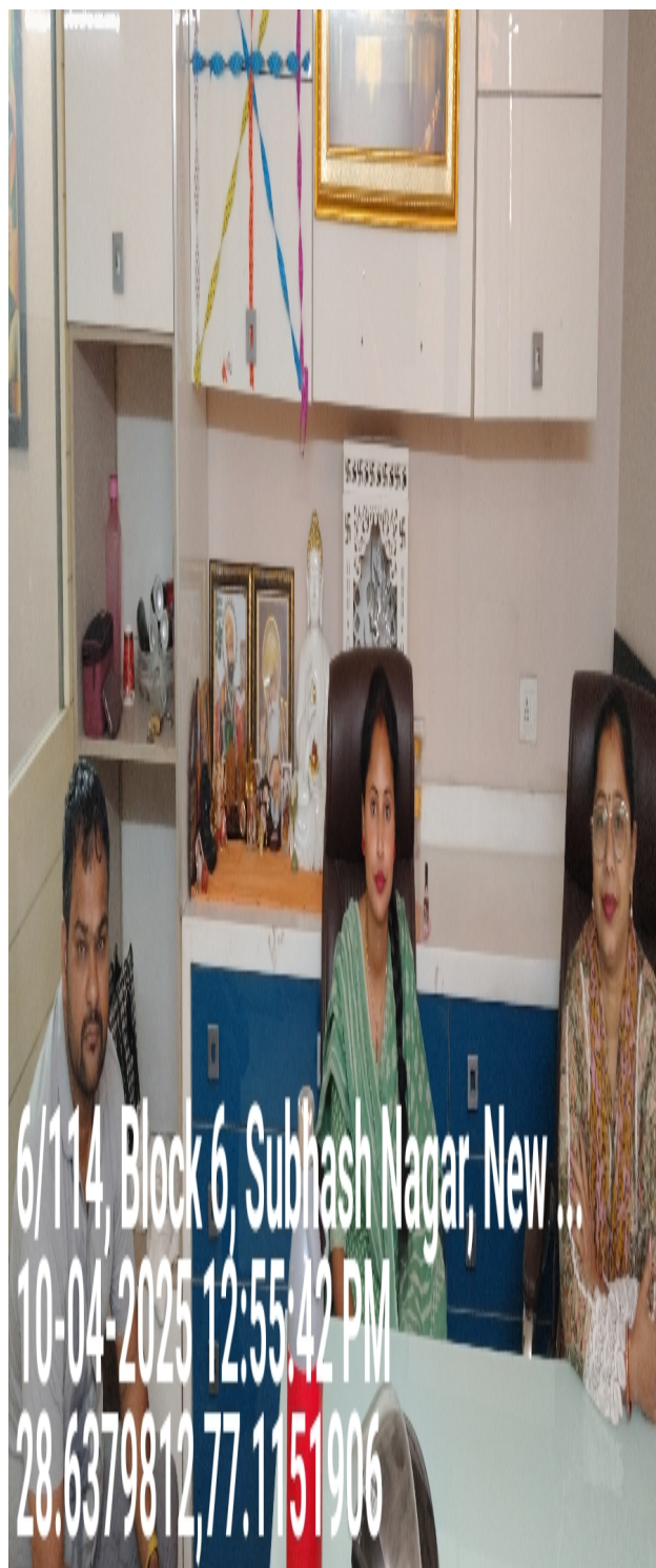
Office setup with employees