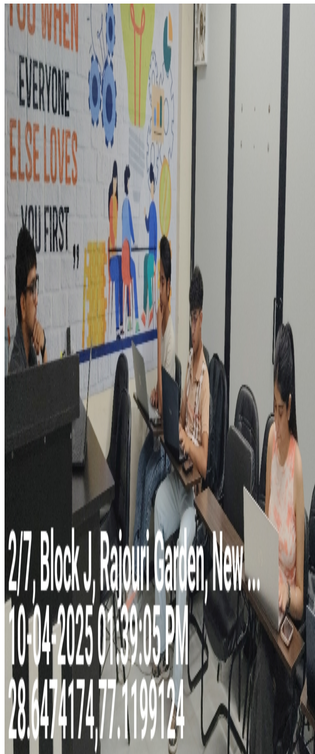
Office setup with employees

2/7, Block J, Rajouri Garden, New ... 10-04-2025 01:39:05 PM 28.6474174,77.1199124