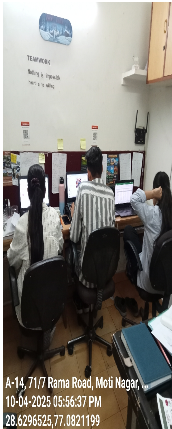
Office setup with employees