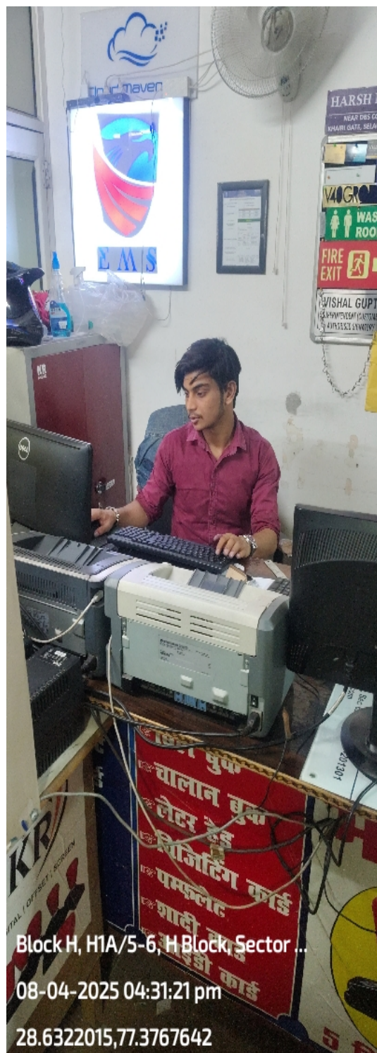
Office setup with employees