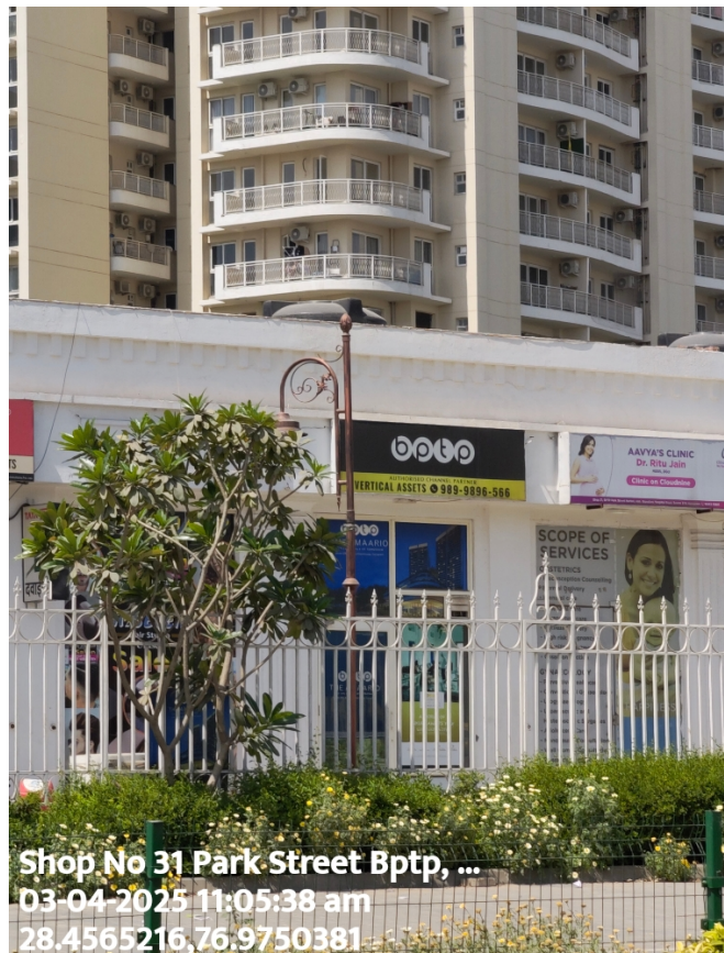
Shop No 31 Park Street Bptp, ... 03-04-2025 11:05:38 am 28.4565216,76.9750381

Shop inside with inventory photos establishing that the inside is of the same shop where the front photo was taken