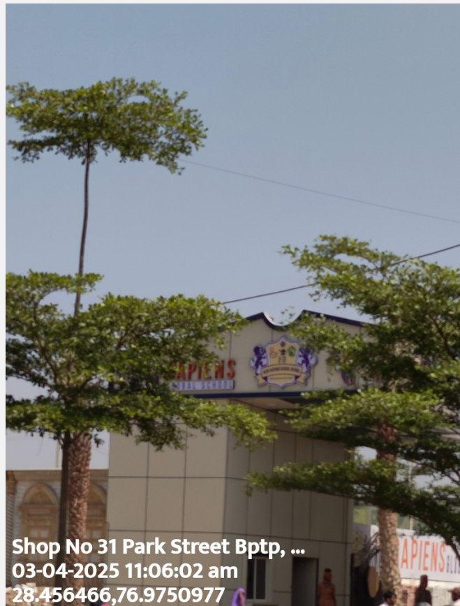
Shop No 31 Park Street Bptp, ... 03-04-2025 11:06:02 am 28.456466,76.9750977

Shop front with horizontal view covering the left & right of the shop establishing if the shop is an individual structure, in a marketplace, highway, isolated place, in a cluster framework.