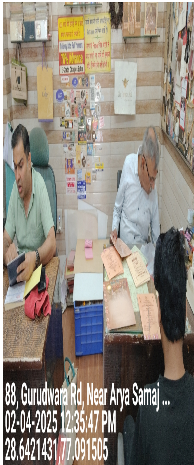
Office setup with employees

88, Gurudwara Rd, Near Arya Samaj ... 02-04-2025 12:35:47 PM 28.6421431, 77.091505